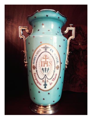
Holy Spirit- Saint Laurent-sur-Sèvre