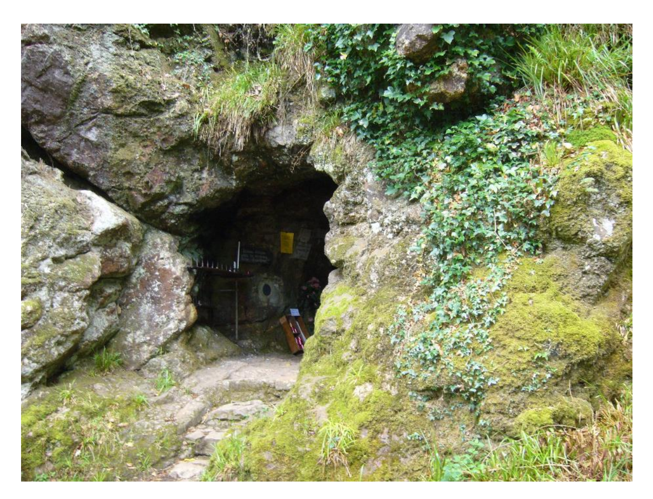
"The anxiety of the search" Cave-Hermitage of Father de Montfort (Forest of Mervent)