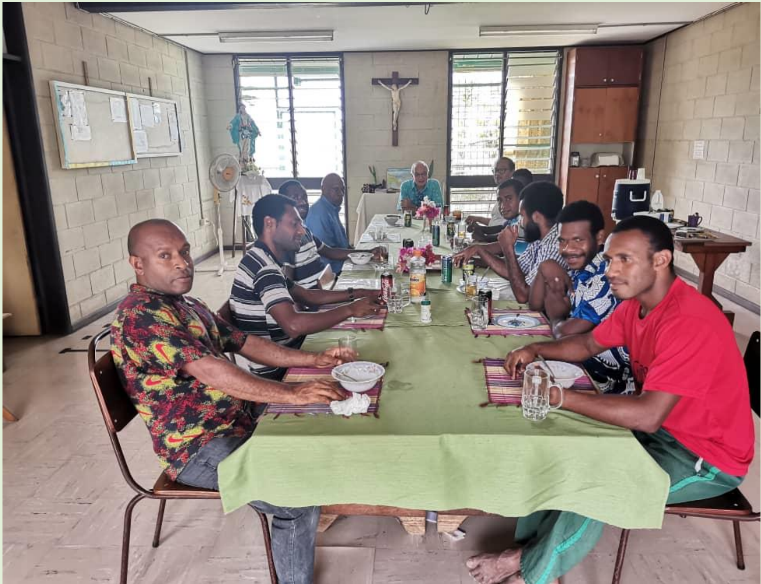
Atmosphere in the dining room of the “Montfortian House”, Bomana, Port Moresby, PNG.