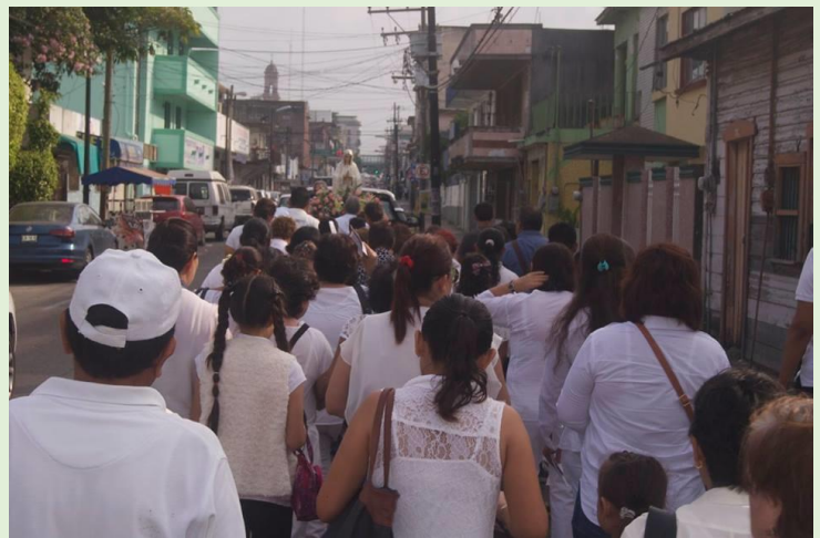
Annual Pilgrimage of the Consecrated People on the solemnity of the Mystery of the Incarnation.

There is something that we have learned deeply from the life testimony of this great Missionary, Fr. Mont-fort: it is his obedience to God, the Church, the Blessed Virgin and charity with his neighbor. This has helped us face the challenges that we are living now with great hope. This is God's work and that with love, in communion with our brothers, everything will find its solution.