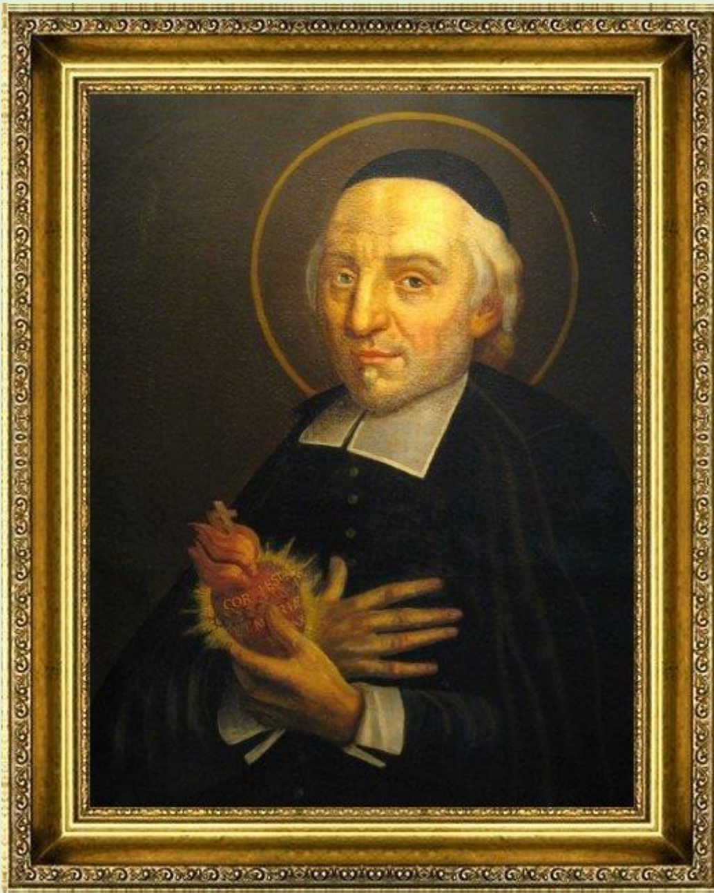
St Jean Eudes