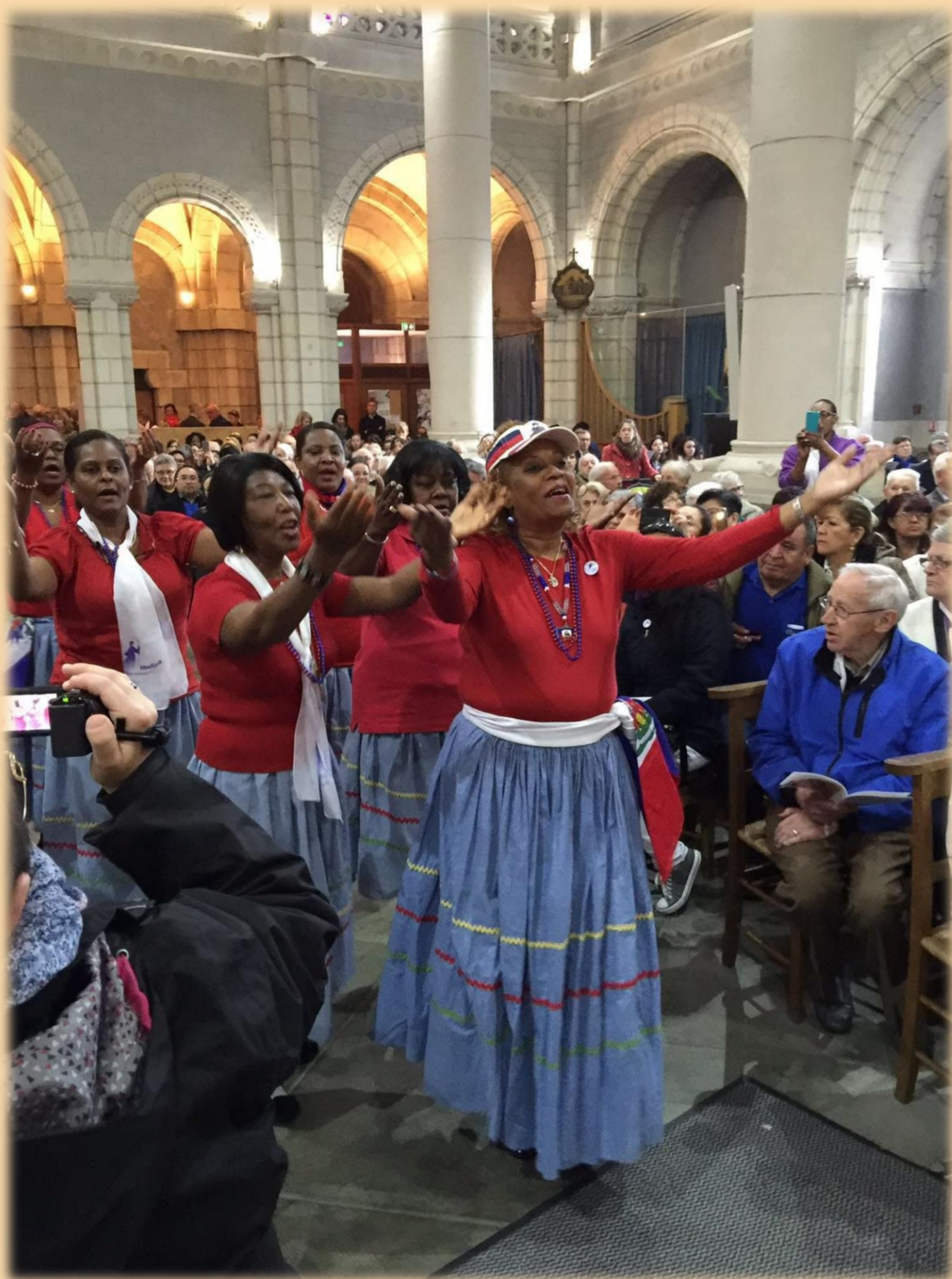
The Associates during the processional song of the offerings, during the ceremony of the feast of the Tercentenary of the death of Father de Montfort, in the Basilica of Saint Louis-Marie de Montfort in St Laurent-sur-Sèvre.