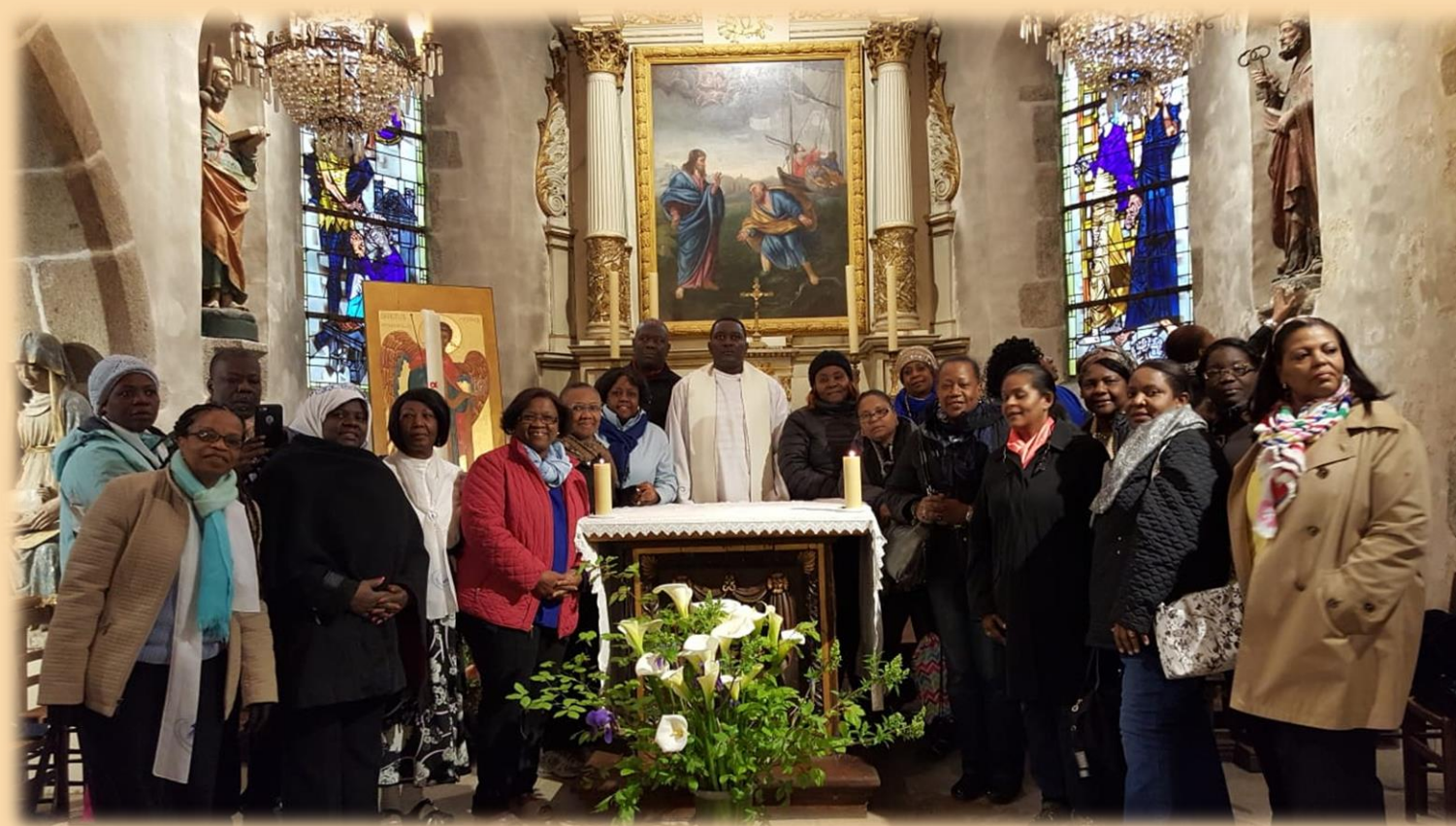
Celebration during Mass at Mont Saint-Michel, with the Associates

6- A good relationship remains among us, Montfort Missionaries who worked in this pastoral mission-study in the Diocese of Rockville Center, who accompanied the Associates and continue to guide them on the right path.