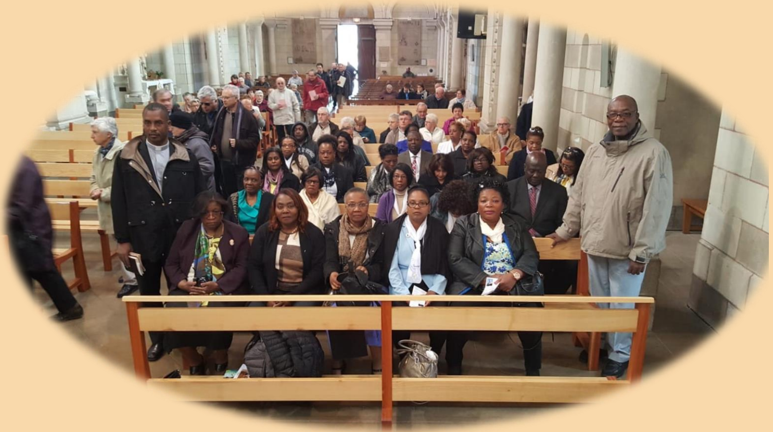
P The Associates in Lourdes