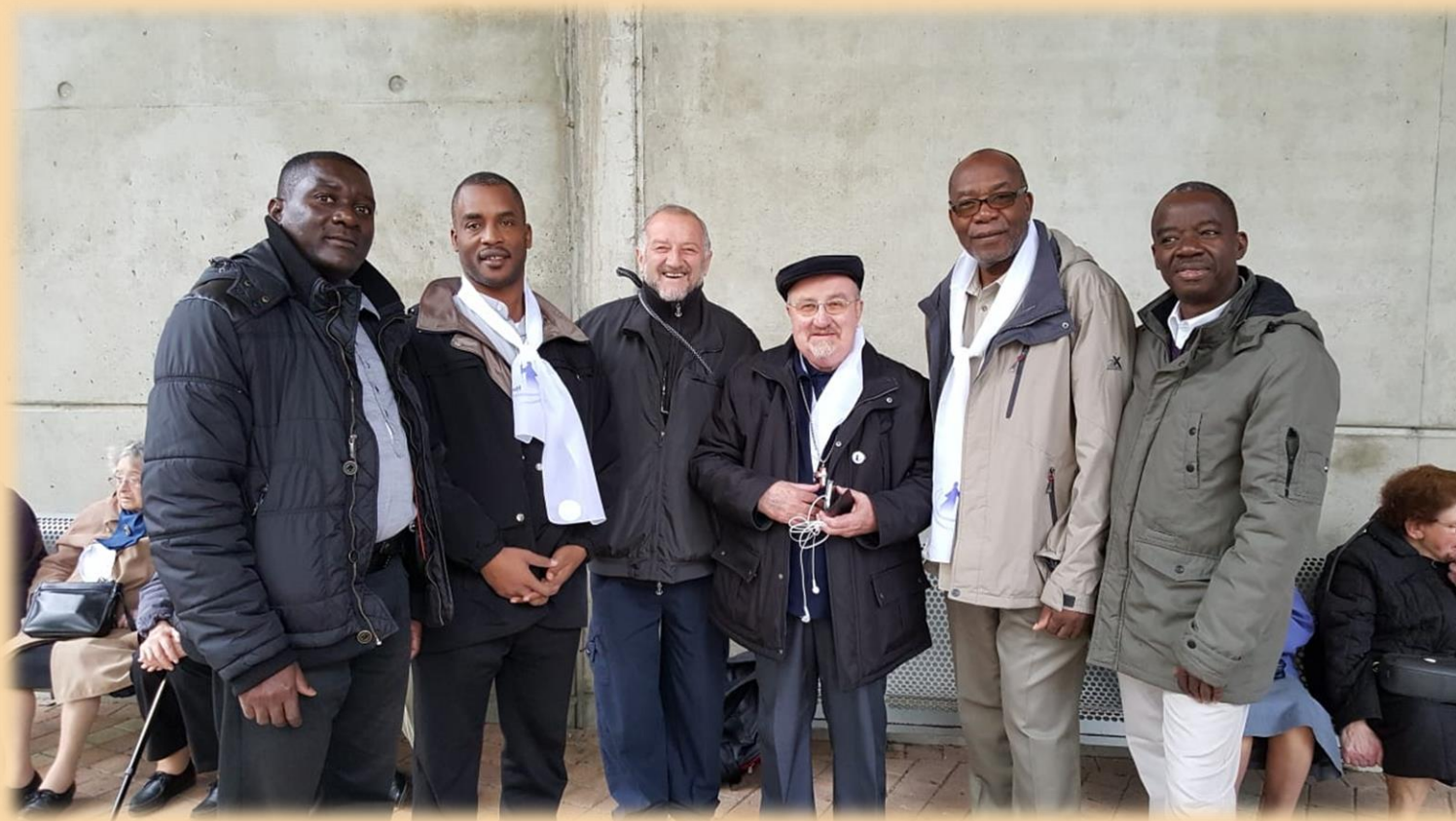
The Associates in Lourdes

At the end of each Retreat and feast of Saint Louis-Marie de Montfort, a big supper is organized by the Parish which welcomes with the contribution of the other Parishes, thanks to the good relationship provided by the Coordinator and the various Committees.