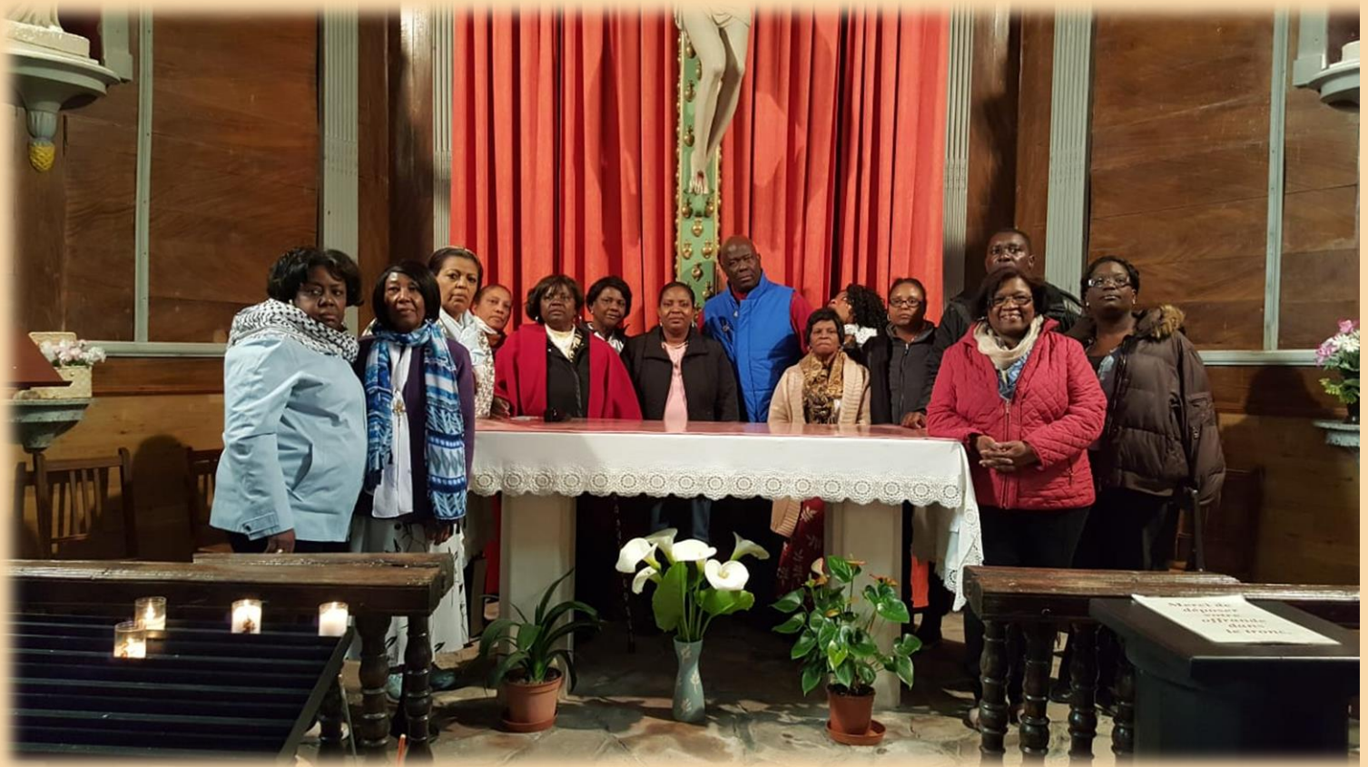
The Associates of New York in the Chapel of Pont-Château