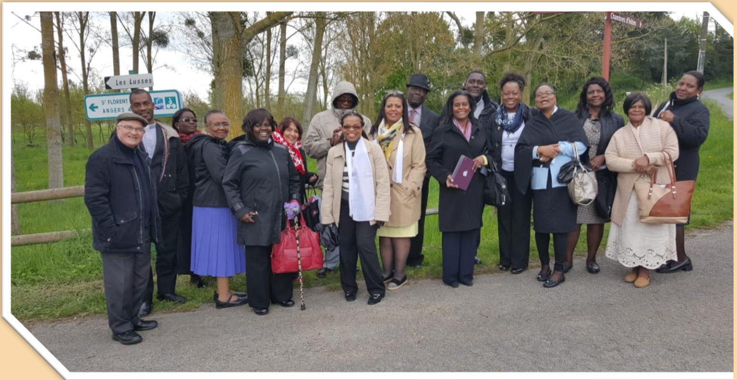
The Associates in Marillais for Sunday Mass, with the Community

8- A concern! If one day the Montfort Missionaries no longer worked in the Diocese of Rockville Center, this could cause the total disappearance of all the groups in the different Parishes. ■