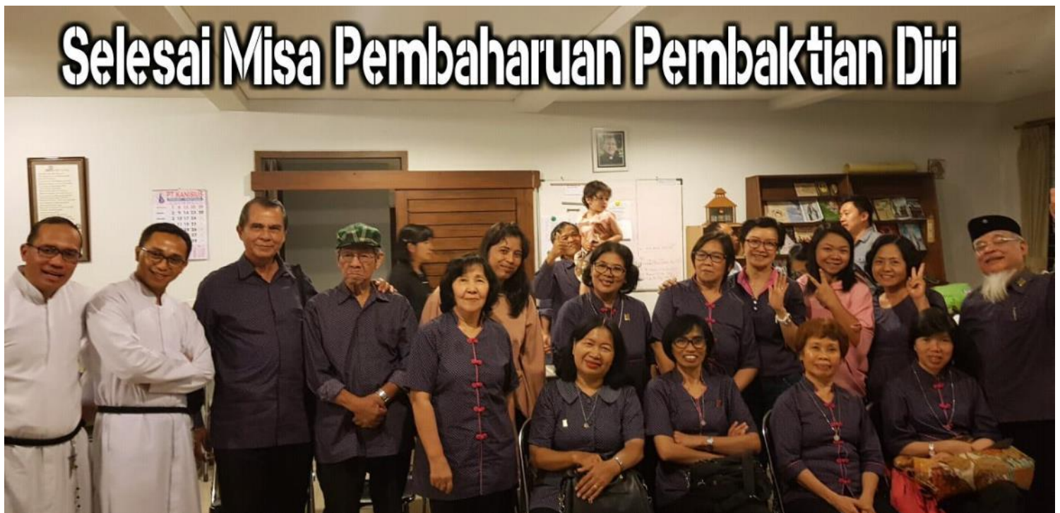
After the Consecration to Jesus Christ through Mary