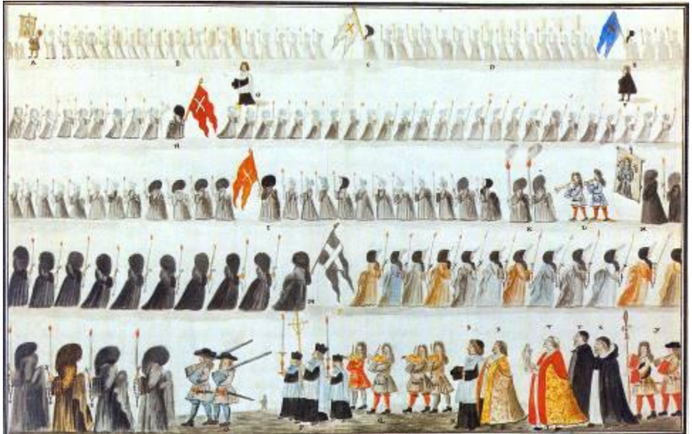
Drawing of the procession at the end of the mission in La Rochelle, by an eye-witness