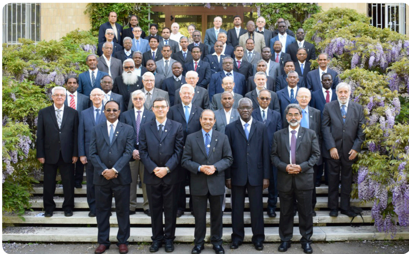
Group photo of the 32 nd General Chapter Members