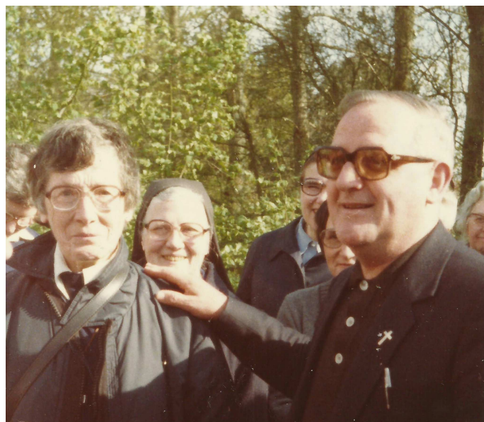
April 1981, “In the Footsteps of Montfort”