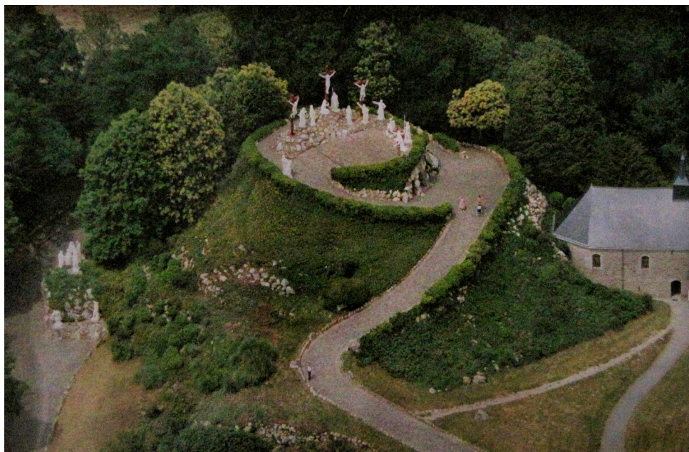
Bird's eye view of the present Calvary