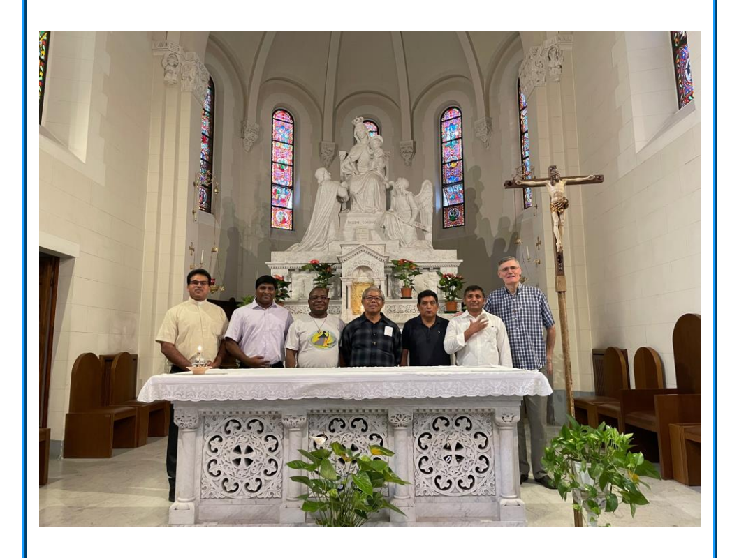
Rome – Casa Generalizia