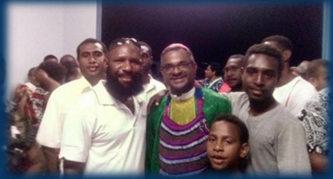
Bishop Rozario Menezes S.M.M.

The people of Mandok Island are very poor. There is no electricity or mobile network on this island. The island is thickly populated and hence they have to go to another island to make garden for their food. They go to another island where there is a possibility of getting water for consumption. They have to go to a completely different island to find fire wood to cook their food. Even for the basic services of education and health they have to go to two different islands. A canoe with its paddles is the common means of transport to meet all their basic needs. When the sea is rough, they cannot travel and hence they remain without food for days.