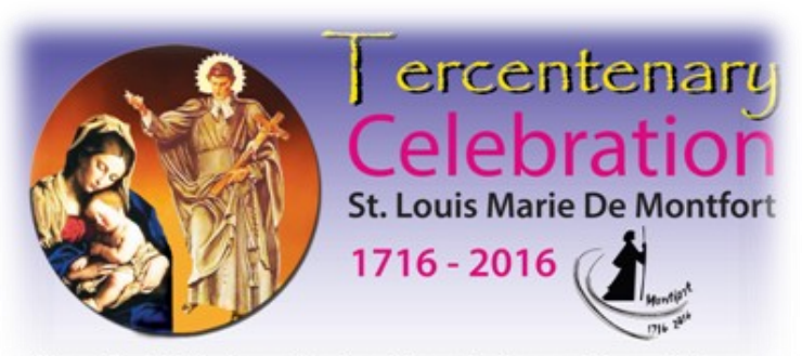
Montfort Missionaries Inc Morata Papua New Guinea

We just celebrated the closing of our tercentenary celebration marking the death of our founder Father de Montfort. It was an opportunity for the Montfortian family not only to celebrate joyfully this great event but also through the