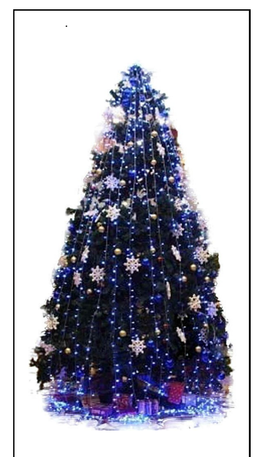
Merry Christmas and Happy New Year 2013